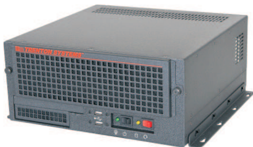
Trenton TVC3400 Shelfmount / Wallmount Video Controller Shown with a MicroATX motherboard