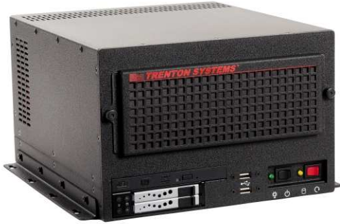
Trenton TSC4600 Shelfmount / Wallmount Computer Shown with a Dual-Processor MicroATX motherboard