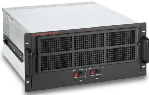
Trenton TRC5001 Rackmount System Shown with a two-segment backplane and two SBCs