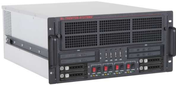
Trenton TRC5003 Rackmount System 1 Shown with a four-segment backplane and four SBCs