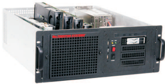
Trenton TCS4501 Standard System Factory-configured rackmount computer with four NVIDIA® Tesla® GPU Cards