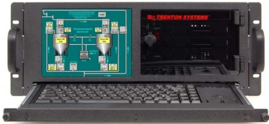
Trenton TRC4007 Rackmount System Shown with a 14-slot backplane and one SBC