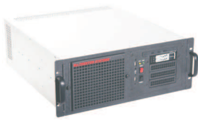
Trenton TRC4008 Rackmount System Shown with a 14-slot backplane and one SBC