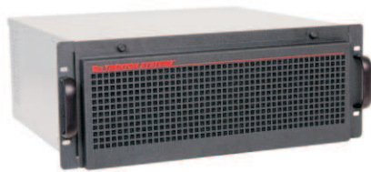
Trenton TRC4009 Rackmount System Shown with a 14-slot backplane and one SBC