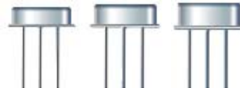
B3 BS B4