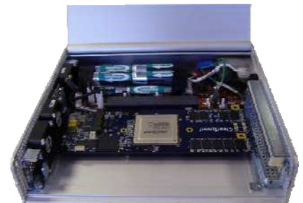
An Advance e710 mounted in a Magma ExpressBox

Visit www.clearspeed.com for the latest performance and product information