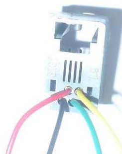
Figure 2.2 Handset wire connection to the standard 616E jack.