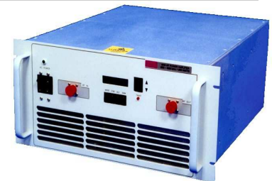
FE Model Shown

Specifications subject to change without notice.