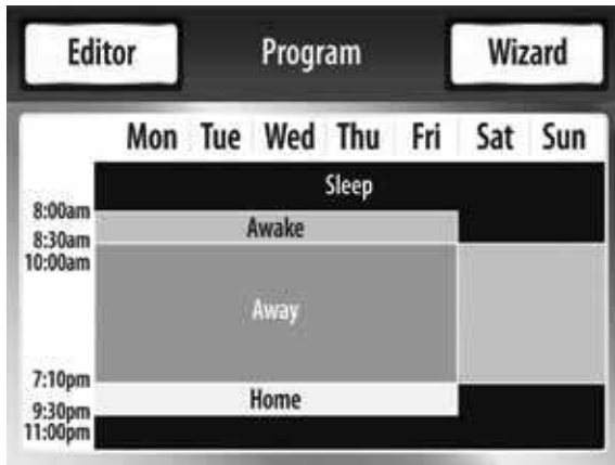
Program summary screen