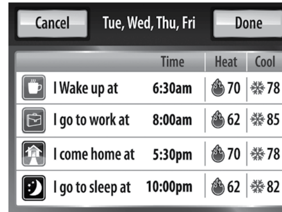
Editor summary screen

Note: Humidity levels are not included as a programmable option, even if a humidifier or dehumidifier is installed and controlled by the Smart Thermostat.