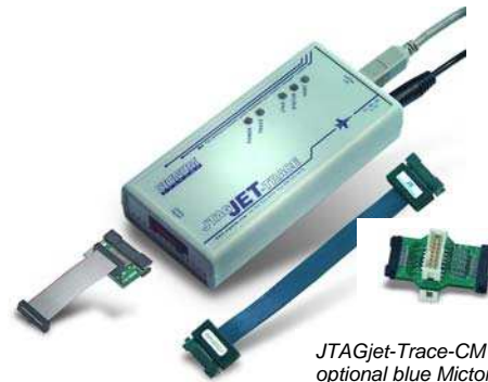
JTAGet-Trace-CM shown with optional blue Mictor-38 cable and JTAG splitter (green)

Trace window showing real-time trace information captured during program execution. Full program path (PC) is shown with function names and the corresponding assembler and C/C++ source code. In addition, on-chip Comparators (shown in the setup window) were set to generate ITM data trace for Buf1[0] and Buf1[2] accesses. Comparator2 is used to generate ETM Event to start the trace on processing function and Comparator3 is used to stop the trace on write to location Buf1[2] . Red line shows trace discontinuity. Yellow line shows STRB instruction (which was a write of 0x47 to Buf1[2] that stopped the PC trace). Timestamp is being shown in two columns (in ms and CPU cycles). The gap in trace capture was for 12778 CPU cycles (~178 ms). Current Trace Clock frequency is shown as 36MHz . Cortex-M CPU always runs twice as fast as the Trace Clock, so the CPU speed is 72 MHz .