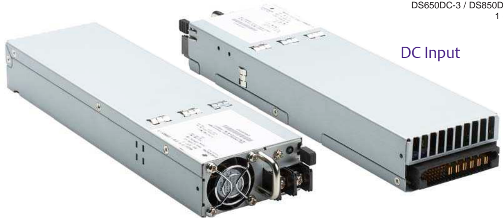
Connector input shown

Distributed Power Bulk Front-End Total Output Power: 650 - 850 Watts +3.3Vdc Stand-by Output Standard Telco input range -39 V to -72 VDC