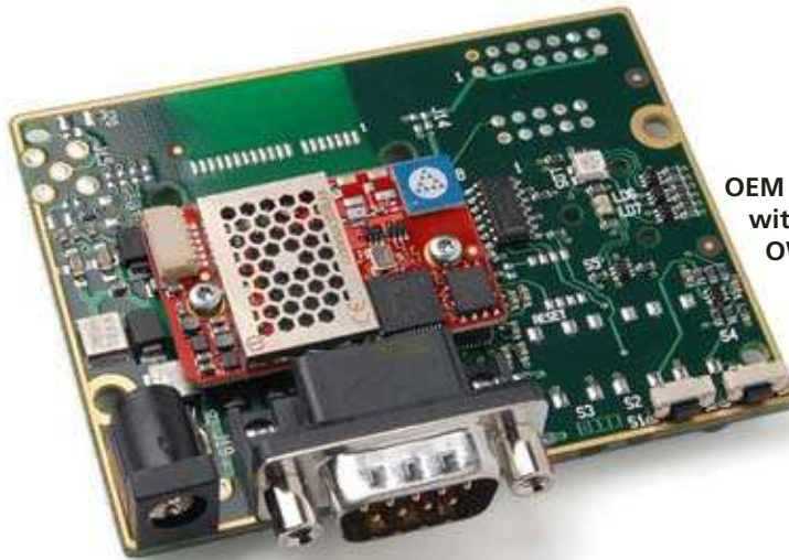
OEM RS232 Module Adapter III with Wireless LAN module OWSPA311gi