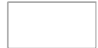
Steel wire perimeter reinforcing frame for extra strength and durability