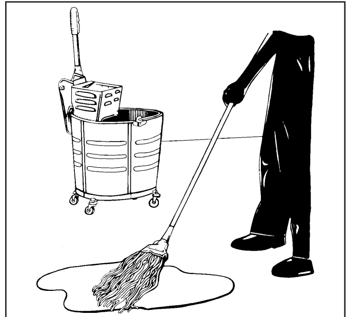
Figure 3. Applying the Statguard® Low Residue Floor Stripper with a cotton mop