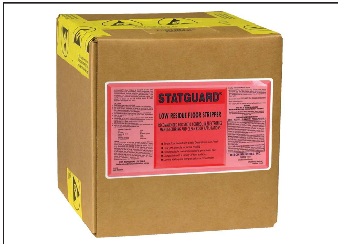
Figure 1. Statguard® Low Residue Floor Stripper