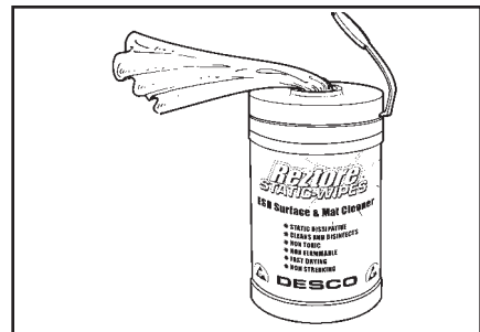
Figure 2. When separating a tissue, tear at an angle.

Lift the container cover from the canister and remove the seal from the lip of the container. Locate the first wipe in the center of the roll of wipes. Feed and push the first wipe through the hole in the center of the top cover and firmly re-attach the cover to the canister.