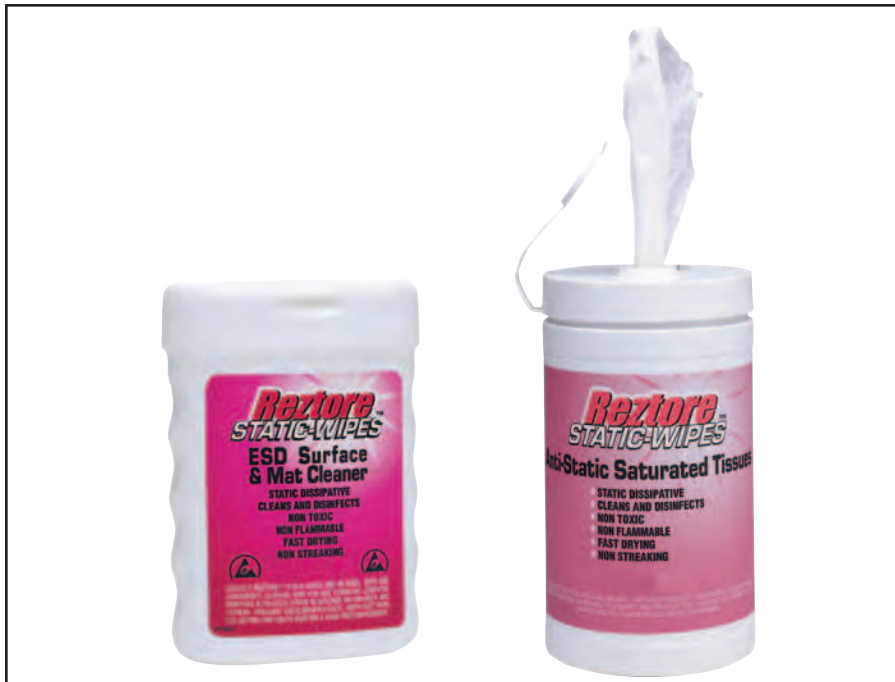
Figure 1. Reztore™ Static-Wipes: 60 Wipes in an Anti-Static Canister 160 Wipes in an Anti-Static Canister