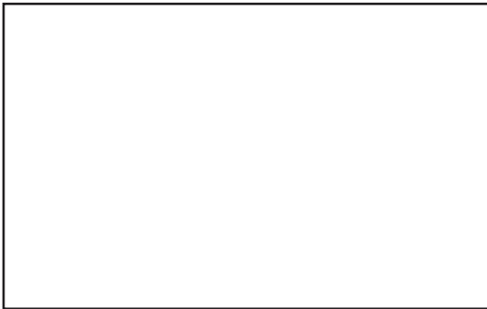
Figure 3: Connecting the hose to the airflow inlet.