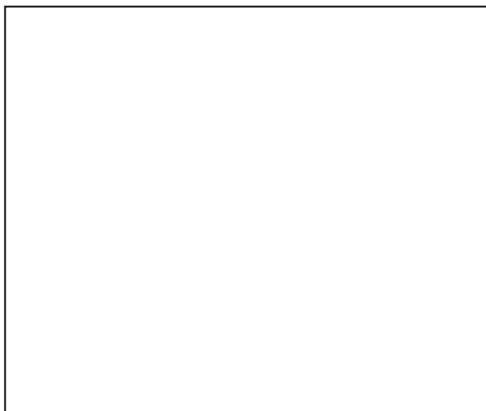
Figure 5: Removing and Changing the Filter