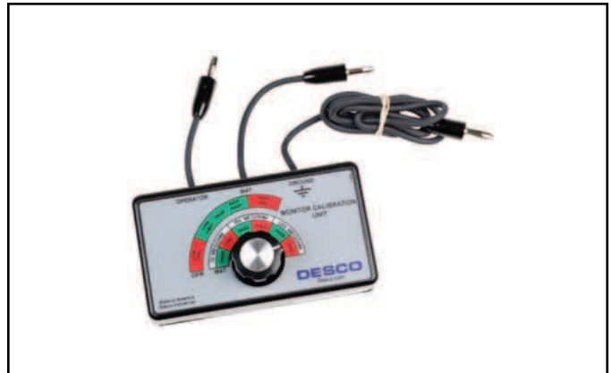
Figure 7. Desco 98220 Single-Wire Monitor Calibration Unit

Because of the impedance sensing nature of the test circuit, special equipment is required for calibration. We recommend that calibration be performed annually, using the Desco 98220 Single-Wire Monitor Calibration Unit. This Calibration Unit is a most important product which allows the customer to perform NIST traceable calibration on Desco single-wire continuous monitors. It is designed to be used on the shop floor at the workstation, virtually eliminating downtime, verifying that the continuous monitor is operating within tolerances.