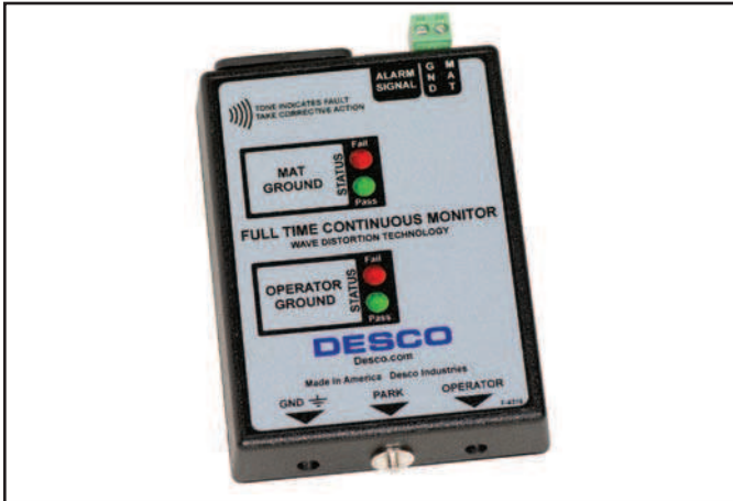
Figure 1. Desco Full-Time Continuous Monitor