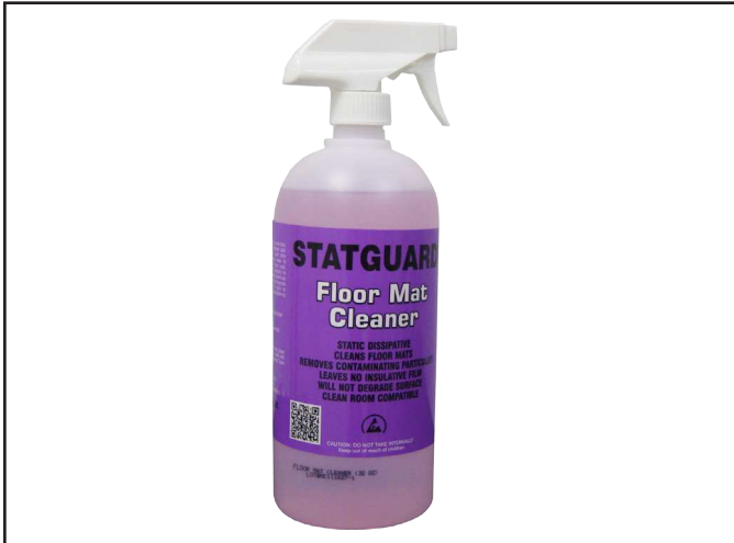
Figure 1. 1 Quart Spray Bottle ( 10443 )