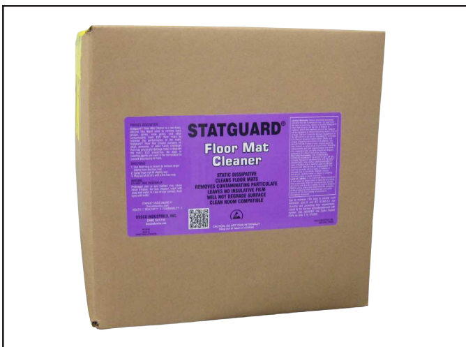
Figure 3. 5 Gallon Bag-in-Box ( 10445 )