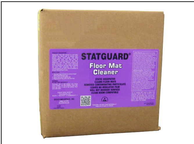
Figure 2. 2.5 Gallon Bag-in-Box ( 10444 )