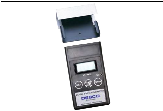
Figure 4. Installing the 19498 Conductive Plate

The Digital Static Field Meter's case has two slots along its sides. The top slot is closest to the face of the instrument. Slide down the tabs of the Conductive Plate into the top slot of the Meter's case as far as they go (see Figure 4).