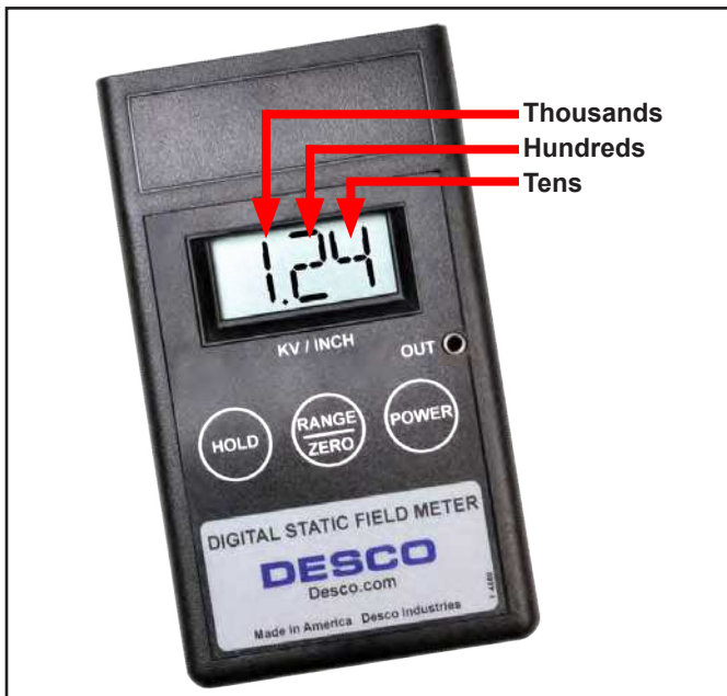
Figure 6. Reading the Digital Static Field Meter while in the \pm 20 kV range

Press the HOLD button to freeze the reading from the object on the display and the analog output signal. This feature allows the operator to move the Meter where it may be more easily read or saved for later reference.