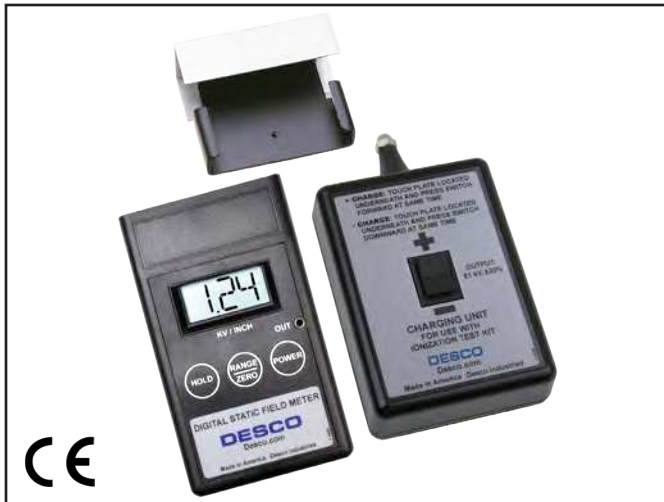
Figure 1. Desco 19493 Ionization Test Kit