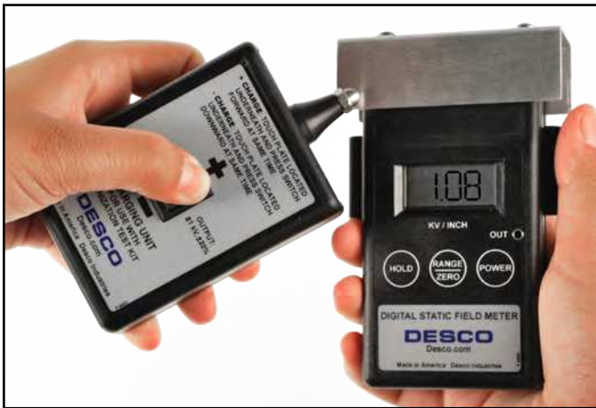
Figure 8. Taking decay measurements

IMPORTANT: A ground path must be provided between the touch plate of the Charger and the ground reference of the Field Meter. This is normally provided by holding the Charger in one hand and the Field Meter with Conductive Plate in the other.