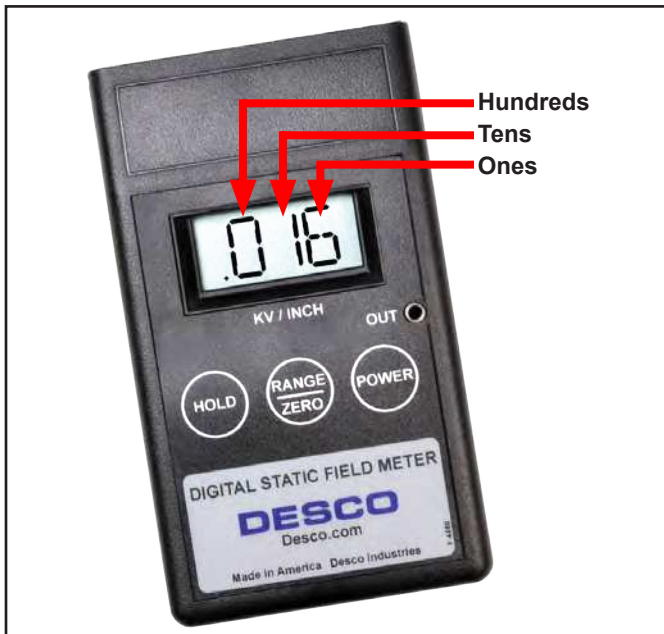
Figure 7. Reading the Digital Static Field Meter while in the \pm 2 kV range

Per ESD TR53-2006 Compliance Verification of ESD Protective Equipment and Materials Air Ionizer Test Procedure Initial Test Setup "Measurements should be