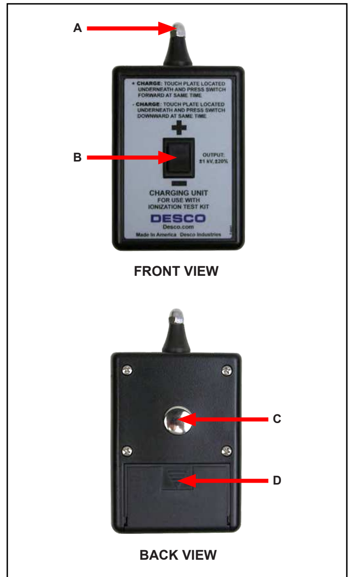
Figure 3. Charger features and components

A. Output Contact: The output contact is connected to an internal power source. When the touch plate located underneath the unit is connected to ground, the output contact will provide a charge of the indicated polarity. The charger is designed so that an operator can press the rocker switch and touch the plate simultaneously with the fingers of the same hand.