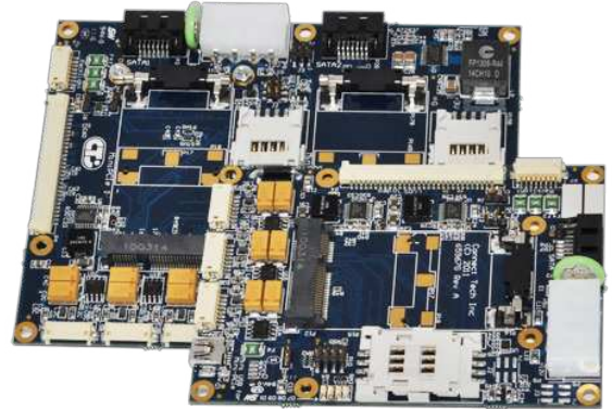
Note: Qseven module mounted on bottom. Qseven module sold separately.

Ultra Lite Qseven Carrier Board - QCG005, QCG011, QCG015 and Lite Qseven Carrier Board - QCG006