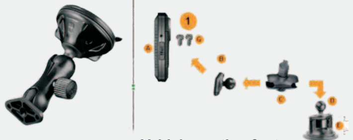
Vehicle suction foot