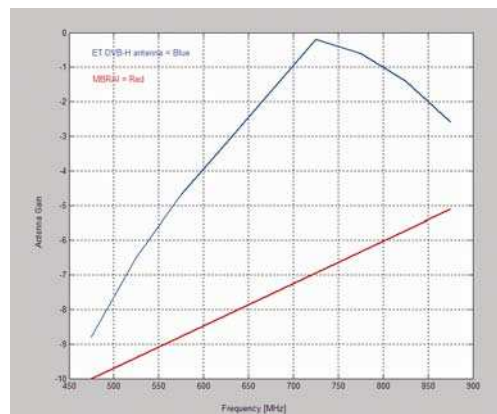
Ethertronics' UHF antenna gain solution performance: measured DVB-H gain compared to MBRAI specification