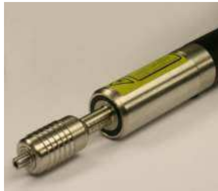
FIBERPOINT® 250MD with Adapter