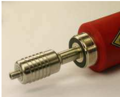
FIBERPOINT® 250 with Adapter