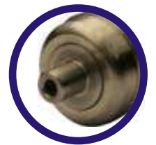
Ferrule 1.25 mm