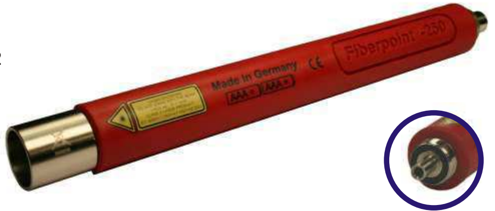
Ferrule 2.5 mm