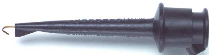
Model 4555 Do-It-Yourself Minigrabber Test Clip