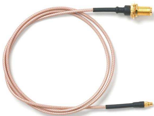
Model 73078 MMCX Plug to SMA Bulkhead Jack, RG178B/U

Small size, and durability for confident connections