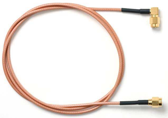
Model 73069 SMA Plug to SMA Right-Angle Plug, RG316/U