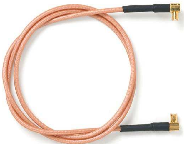
Model 73068 MCX Right-Angle Plug to MCX Right-Angle Plug, RG316/U

Snap-on coupling and miniature size for fast connect and disconnect where space is limited