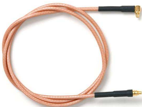
Model 73064 MMCX Plug to Right-Angle MMCX Plug, RG316/U

Snap-on coupling and micro-miniature size for fast connect and disconnect where space is limited