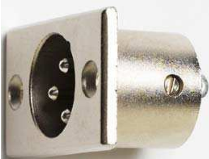
Model 5117A XLR (M) 3-Pin Rectangular Flanged Mount