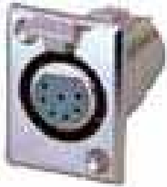
Model 6854 XLR (F) 5-pin rectangular flanged mount

Protect contacts and absorb vibrations in your audio applications.