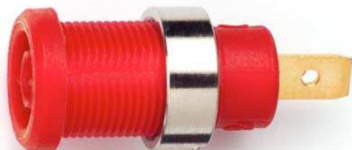
Model 72913 Panel Mount IEC61010 4mm (0.16in) Jack for Sheathed Banana Plugs

Panel Mt IEC61010 4mm (0.16in) Jack for Sheathed Banana Plugs