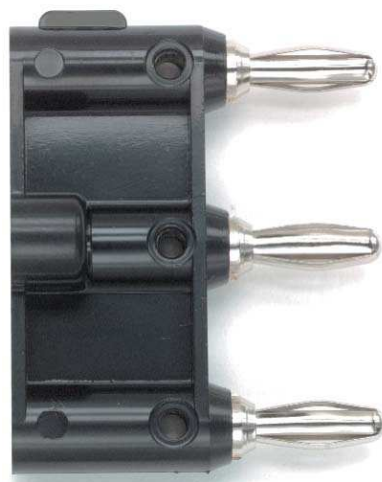
Model 2970 Triple Banana Plug