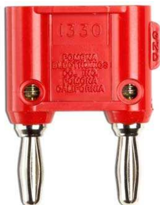
Model 1330 Double Banana Plug with Component Mounting Area