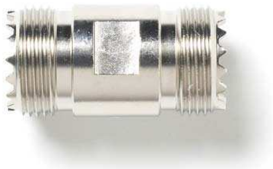
Model 73058 UHF Jack to Jack Adapter