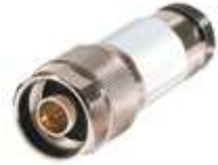
CASE STYLE: FF779