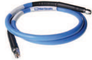
CASE STYLE: MB1629-6.56