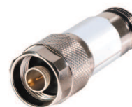
CASE STYLE: FF779