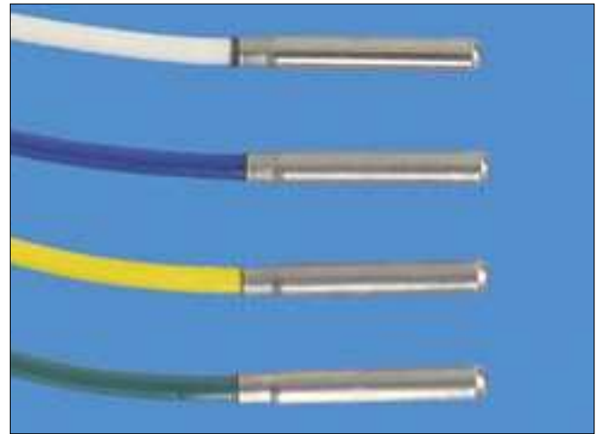
Ruggedized Thermistor Sensor

The ruggedized temperature sensor can incorporate a wide variety of thermistor curves and resistances. Other options include cable lengths and terminals. It can also be used with the ATP Clip-On for 3/8" and 1/2" copper pipes ( see page 19 ).