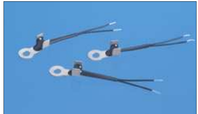
ATP RT24 Surface Temperature Sensor

Contact the factory for specific design or application information or the availability of options.