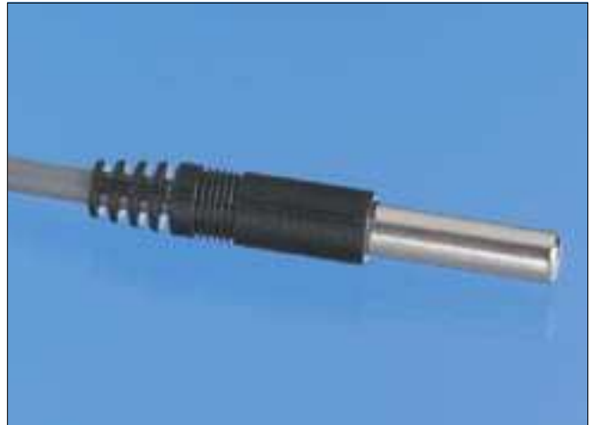
General Purpose Thermistor Sensor

Please contact the factory for specific design or application information or the availability of options.