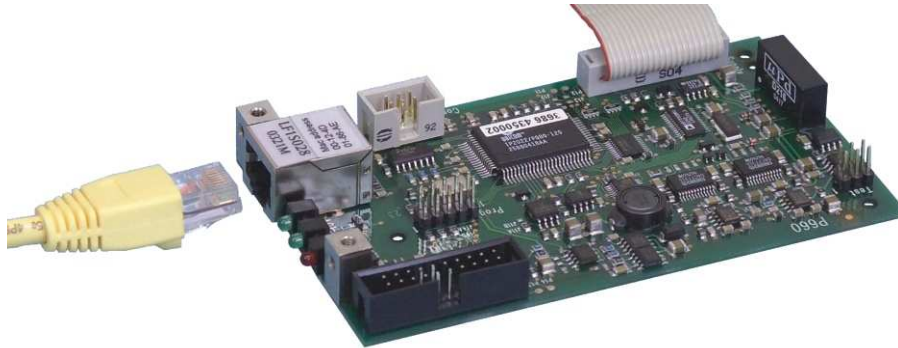
Card for inserting in power supply