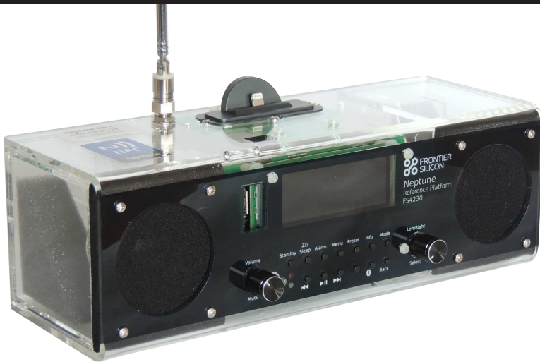
NEPTUNE REFERENCE PLATFORM