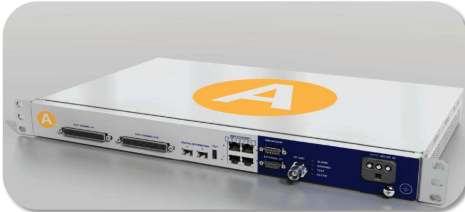
Transcend™ VP Indoor Unit (IDU)