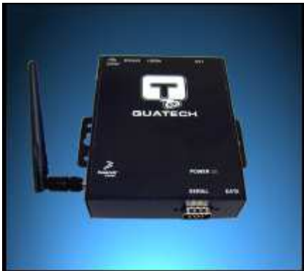
Quatech wireless (802.11b) device servers are available in 1 or 2-port configurations.

When you need the ultimate in wireless device server performance, ease of use and flexibility, specify Quatech.