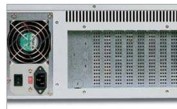
Excellent Cooling System New slot cover for better ventilation