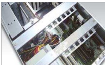
Two Adjustable Card Retainer Positions For fixing all the cards more flexibly and tightly