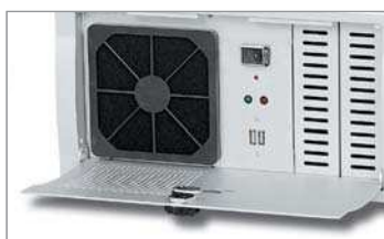
Plastic Fan Filter For easy cleaning and replacing